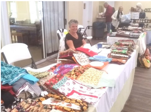
Vendors bring a wide variety of items.